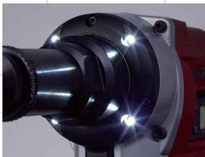
Equipped with work light that can be turned ON/OFF