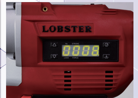
Counter function (indicates number of fastened rivet nuts on the body)