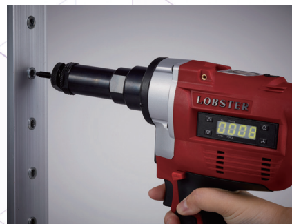
The cordless-type N1B1 can be used on any worksite.